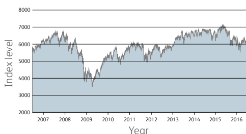
FTSE 100 Index